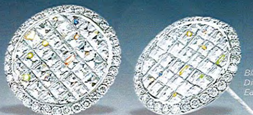
Blaze Cut Diamond Earrings